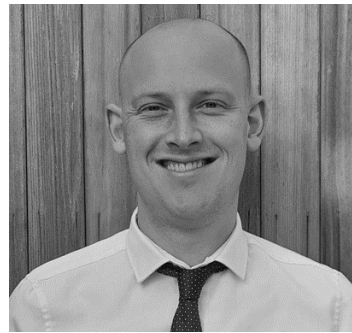
Head of Sixth Form Head of Year 13 Head of Year 12 Y12 Study Supervisor & UCAS Administrator Sixth Form Administrator Head of Careers Lead Careers Adviser